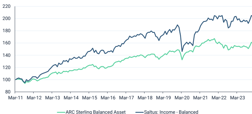
Long term performance